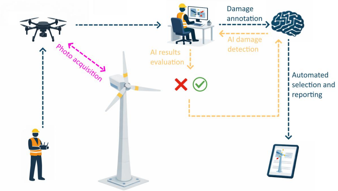
Fig. 1: Workflow of the proposed UAV-based inspection and YOLOv8-assisted damage detection framework for wind turbine blade condition assessment.

It should be emphasized that the presented research represents an initial stage of ongoing work. At this phase, preliminary analyses were conducted, and a first proof-of-concept implementation of an AI-based detection model was developed using the YOLOv8 architecture. YOLO (You Only Look Once) belongs to the family of one-stage object detection algorithms, where localization and classification are performed simultaneously in a single forward pass. The preliminary detection capability of the model is demonstrated in Fig. 2, which presents example UAV inspection images with bounding boxes highlighting damage candidate regions. These include typical surface defect patterns such as erosion marks, cracks, and discoloration. Although the current results should be treated as exploratory, they confirm the feasibility of integrating UAV inspection workflows with modern deep-learning detection frameworks. Future work will focus on expanding the dataset and performing systematic quantitative validation under operational conditions.