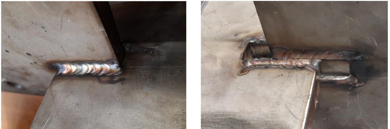
Fig. 1 Stainless steel plates welded by the TIG method (left), typical failure mode (right).